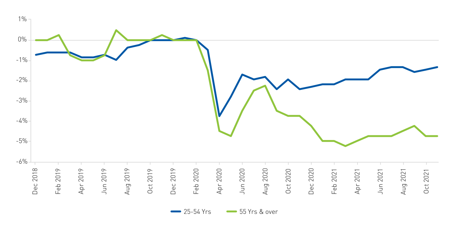
Change in labour force participation rate is seasonally adjusted, with base value of 0% on December 2019.